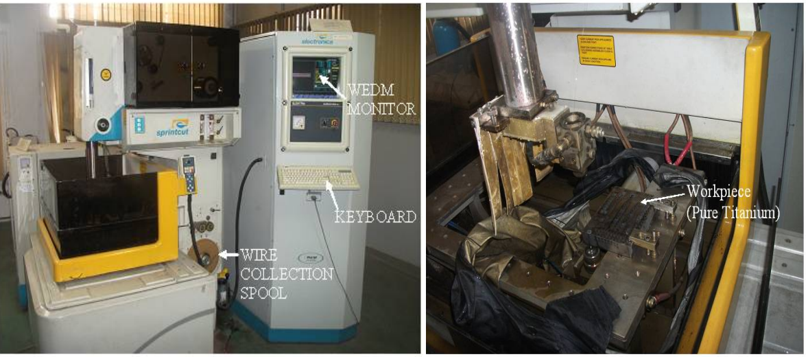
Fig.2. (a) Experimental Set up and (b) titanium workpiece machined with WEDM

factor at a time' (OFAT) approach, to recognize the trends of influence for the machining variables. Table 2 depicts the levels of the selected process variables. The orthogonal array forms the basis for the experimental analysis in the Taguchi method. The selection of orthogonal array is concerned with the total degree of freedom of process parameters. Total degree of freedom (DOF) associated with six parameters and three one way interactions is equal to 24 (4 \times 3 + 6 \times 2) . The degree of freedom for the orthogonal array should be greater than or at least equal to that of the process parameters. Thereby, a L27 orthogonal array having degrees of freedom equal to 26 has been considered in present case. The experimental layout along with the mean values of the responses is shown in Table 3. Input parameters and their interactions were allocated using modified linear graph. Analysis of variance (ANOVA) was performed using Minitab16 Software.