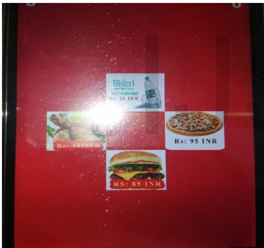
Fig: Menu options at customer mobile