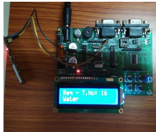
Fig: Order received for water

Following are the screenshots of actual results of our system.