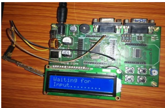
Fig: Status when no input (order)is given