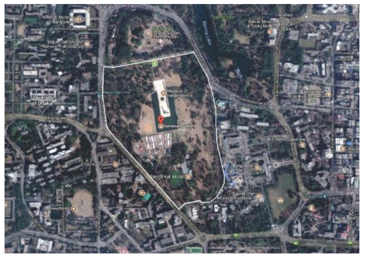
Fig. 3. Sohrawardy Uddan image (March 2014) of the study area. The white boundary line indicates the study area of the whole park premise. The study area is in the bustling city Dhaka.

Metrological Department processed the data from their previous surveys. From the last 16 years of tremendous survey of BMD influenced this observation process very much. These data are collected for Sohrawardy Udyan from the climate division. The boundary of the study region is depicted in Figure 3.