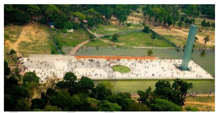
Fig. 2. Suhrawardy Udyan

The park itself is 75 acre & we covered around 60 acres for our study purpose. Our study area contains "Museum of Independence, Dhaka" which is part of a 67-acre complex at Suhrawardy Udyan. There is a "Tower of Light" which is a 50-meter high tower composed of stacked glass panels. The museum is situated beneath the tower of light. A water body of the project reflects the whole tower but now is under potential threat as the local slum-dwellers use it for their daily needs. The museum's plaza area has a 5669 square meter of tiled floor.