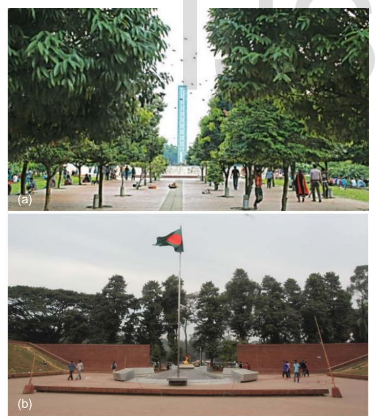
Fig. 4. The Glass Tower of (a)Sohrawardy Udyan and (b) 'Shikha Chironton'

The temperature data is collected from BMD of around 16 years. The thermal data of this area is observed by graph charts for different months in a year. Also, the data contains