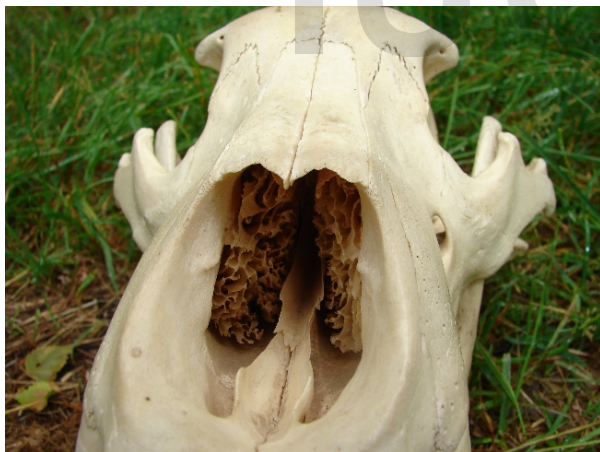
Fig. 1 Nasal Cavity of Grizzly Bear

Bears have an incredible sense of smell because the area of their brain that manages the sense of smell, called the olfactory bulb, is at least 5 times larger than the same area in human brains even though a bear's brain is one third the size.