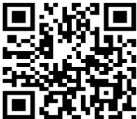
Fig (2.1) QR Code

QR code (abbreviated from Quick Response Code) is the trademark for a type of matrix barcode (or two-dimensional barcode) first designed for the automotive industry in Japan. A barcode is a machine-readable optical label that contains information about the item to which it is attached. A QR code uses four standardized encoding modes (numeric, alphanumeric, byte / binary, and kanji) to efficiently store data extensions may also be used. The QR Code system has become popular outside the automotive industry due to its fast readability and greater storage capacity