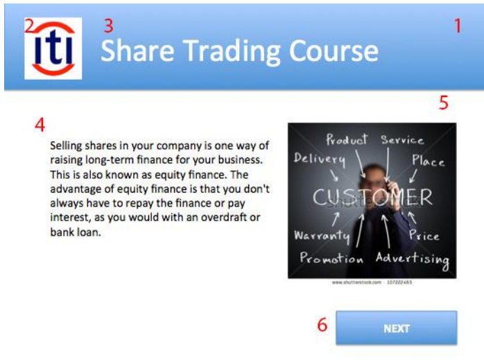
Fig.1 - The sample slide with the element numbers labeled in red. 1) Is a shape with a gradient. 2) Company logo. 3) Title Text 4) Content Text 5) Content Image 6) Next Shape with link

Let us say we create a simple PowerPoint slide with some text and images as given below.