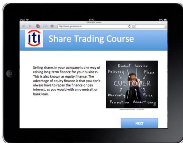
Fig. 5 – Expected output of HTML5 based course running on an iPad

The final outcome should be the working course with interactive buttons on an HTML5 based device as shown in the figure below.