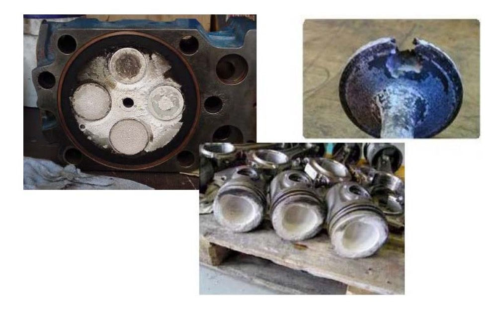
Fig. 1. Defects on engine parts caused by siloxanes [6].

Siloxanes are considered as unwanted and harmful pollutants in biogas obtained from anaerobic digestion and gasification of anthropic wastes [1], [3]. The reason lies in the fouling and mechanical corrosion caused by organic silicon compounds produced from the oxidation of siloxanes during combustion. When biogas is combusted, siloxanes oxidize to form silica. The formation of silica in the combustion engine is problematic since silica is abrasive and also acts as a thermal and electric insulator. As a result, internal combustion engines performance may be greatly reduced and combustion catalysts may be less effective [4], [5]. Figure 1 shows the defect on engine parts, while figure 2 illustrates the fouling of a boiler caused by burning siloxane rich biogas.