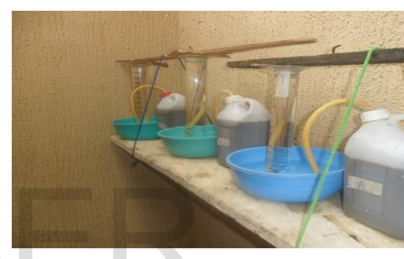
Plate 1.1 Biogas Setup