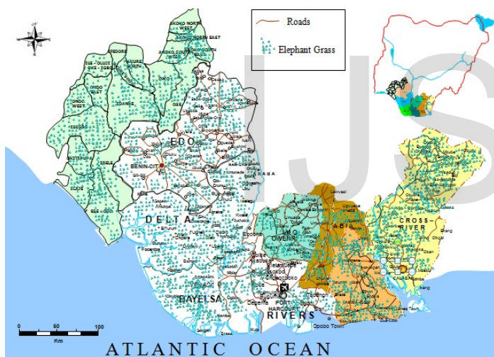
Fig. 3: Map of Niger Delta

Biomass perennial grass fuel is suitable for both household and industrial utilization. Similarly, a shift from fuel wood to perennial grass not only deploys the vast biomass resource but also of significant importance in the development of the Niger Delta region. In this case, dried grasses will be prepared and processed into pellets of predetermined sizes to fit into recommended burners for cooking in rural/urban areas of the Niger Delta and across other states of the federation and neighbouring countries of Africa.