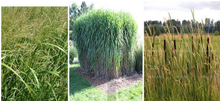
Fig. 1: Swithgrass, Miscanthus and Reed Canarygrass

of it remains underutilized. In some remote communities of the south-south Niger Delta, perennial grasses are used as a solid fuel for direct cooking. In developed countries like the United Kingdom, perennial grasses have been used in co-fired coal power plants [6]. Again perennial grass species have also been deployed as choice feedstock for advanced bio-fuels and for production of cellulosic ethanol [8]. Despite focus on the generation of electricity and production of liquid fuels, perennial grasses can also be pressed into fuel pellets, briquettes, and cubes which can be used as heating fuel to replace or complement fuels made from wood fibres. [20], [23].