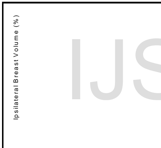
Fig. 2. Cumulative DVH for ipsilateral breast for IORT, APBI, m-IMRT and VMAT.

tissue effects to selected organs during IORT, APBI, VMAT and m-IMRT are shown. Mean and maximal doses in the OARs delivered by IORT were consistently lower as compared to APBI, VMAT and m-IMRT. The maximal dose to the heart is larger during EBRT techniques than after APBI and considerably smaller using IORT. Multi-beam step & shoot IMRT radiotherapy yields the largest maximal dose in the ipsilateral lung (26.3 Gy) and contralateral breast (16.4 Gy). Higher maximal dose is seen for contralateral lung (12 Gy) and spine (9.2 Gy) by VMAT in comparison to other techniques. Due to very low mean doses in the spine, contralateral lung and contralateral breast after IORT and APBI with less than 1.5% of the prescribed dose, it was not possible to calculate exact values for these OARs with the Plato brachytherapy system.