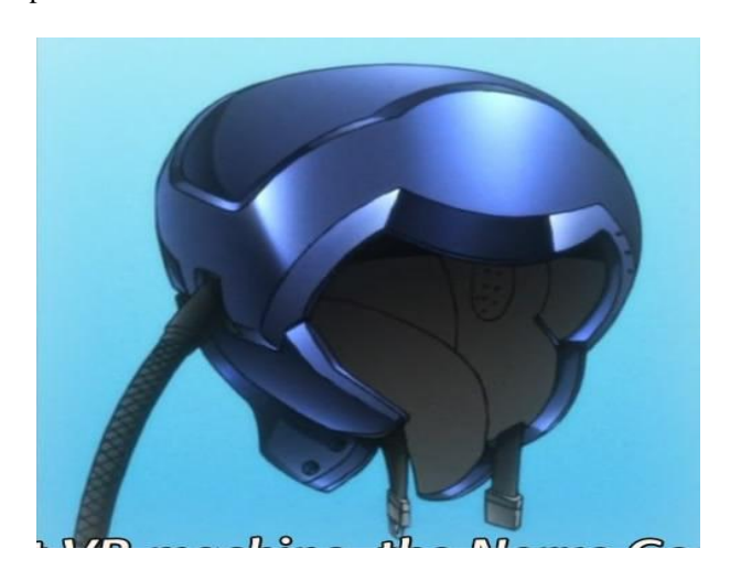
III. VIRTUAL REALITY

slowing of the signal down from electromagnetic spectrum velocity to the meager velocity of 100 m/s. This causes a time lag between the sensations to the reaction in the body. This time lag is not as significant as the human brain itself cannot differentiate the time lag of the almost instantaneous reaction. This inability to detect the time lag is actually of key importance in the creation of VRMMORPG.